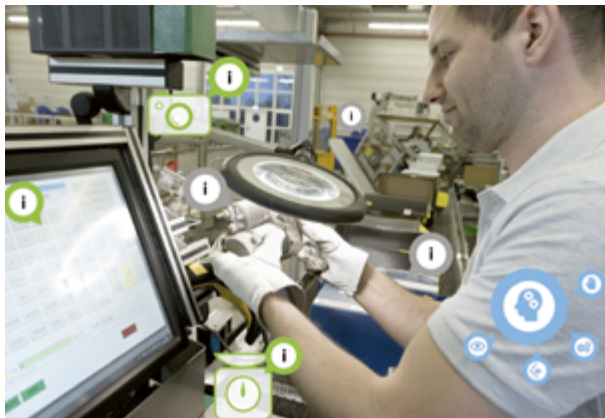
Humans and artificial intelligence complement each other in the project “EIBA”.

The development of the system is based on the example of used car parts (cores). In order to include also challenges and requirements of other products in the development-process, extensive interviews with companies of other industries such as textiles, printer cartridges or semiconductors were conducted. Another important focus in the project is machine vision in which some very promising first results were achieved. Based on image data of approx. 1400 different used parts the AI was able to identify 85% correctly in performance tests. By using a hierarchy of specialized neural networks, the recognition rate could even be improved to more than 90%. As these performance tests have been conducted in controlled conditions, a validation facing the challenges in real industrial environment is pending. For that purpose, all workstations in one C-ECO location have been equipped with cameras and digital scales which have been connected to the identification-software.