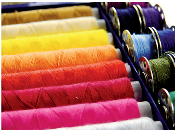
Textile yarn is also recyclable

Prerequisite for the avoidance of rebound effects is a complete substitution of virgin fibre textiles by qualitatively and functionally equivalent textiles made from recycled fibre materials. In addition, the following goods and services may not be offered at lower prices than their conventional counterparts: the circular textiles themselves, associated services, as well as textile raw materials and intermediates.